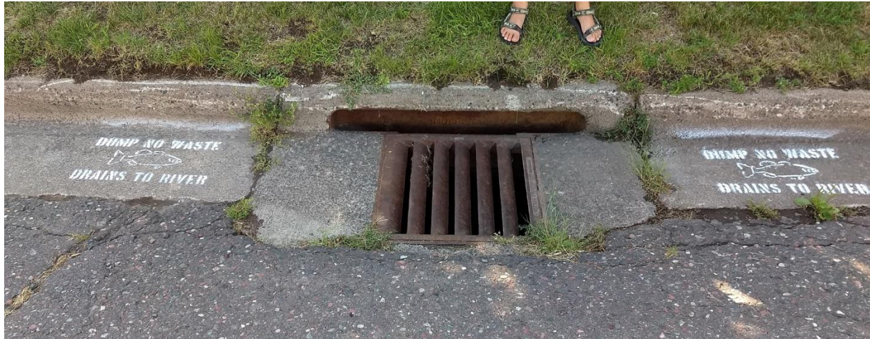
Figure 2. Stormwater

important consideration. Stormwater best management practices help protect property and natural resources by reducing flood risks and flood damage and filtering pollutants before they are washed to lakes and streams. Stormwater management also helps protect groundwater. However, stormwater planning, designs and construction can be expensive.