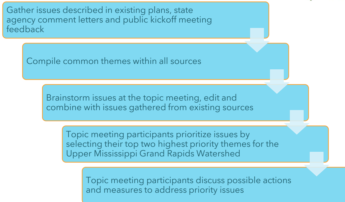
Figure 4. Issue statement development process

A diverse group of stormwater experts plus the Upper Mississippi Grand Rapids Watershed Advisory Committee gathered to brainstorm issues for stormwater in the watershed. The brainstormed list was either grouped with the compiled themes or new themes were created. The group then agreed on a final list of three issue themes (Table 1).