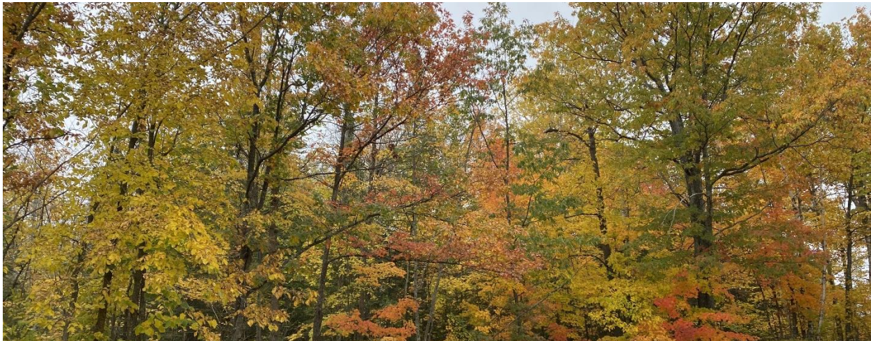
Figure 2. A fall forest near the Mississippi River.

Forests are an important resource for the Upper Mississippi – Grand Rapids Watershed. Forests not only provide valuable habitat for a variety of species, but they also help protect lakes, rivers, streams, and groundwater. Forests help filter and slow the flow of rainwater, allowing it to soak into the ground water rather than run off the land. This prevents pollutants from being washed into lakes, rivers, and streams. Greater than 50% of the watershed is forested.