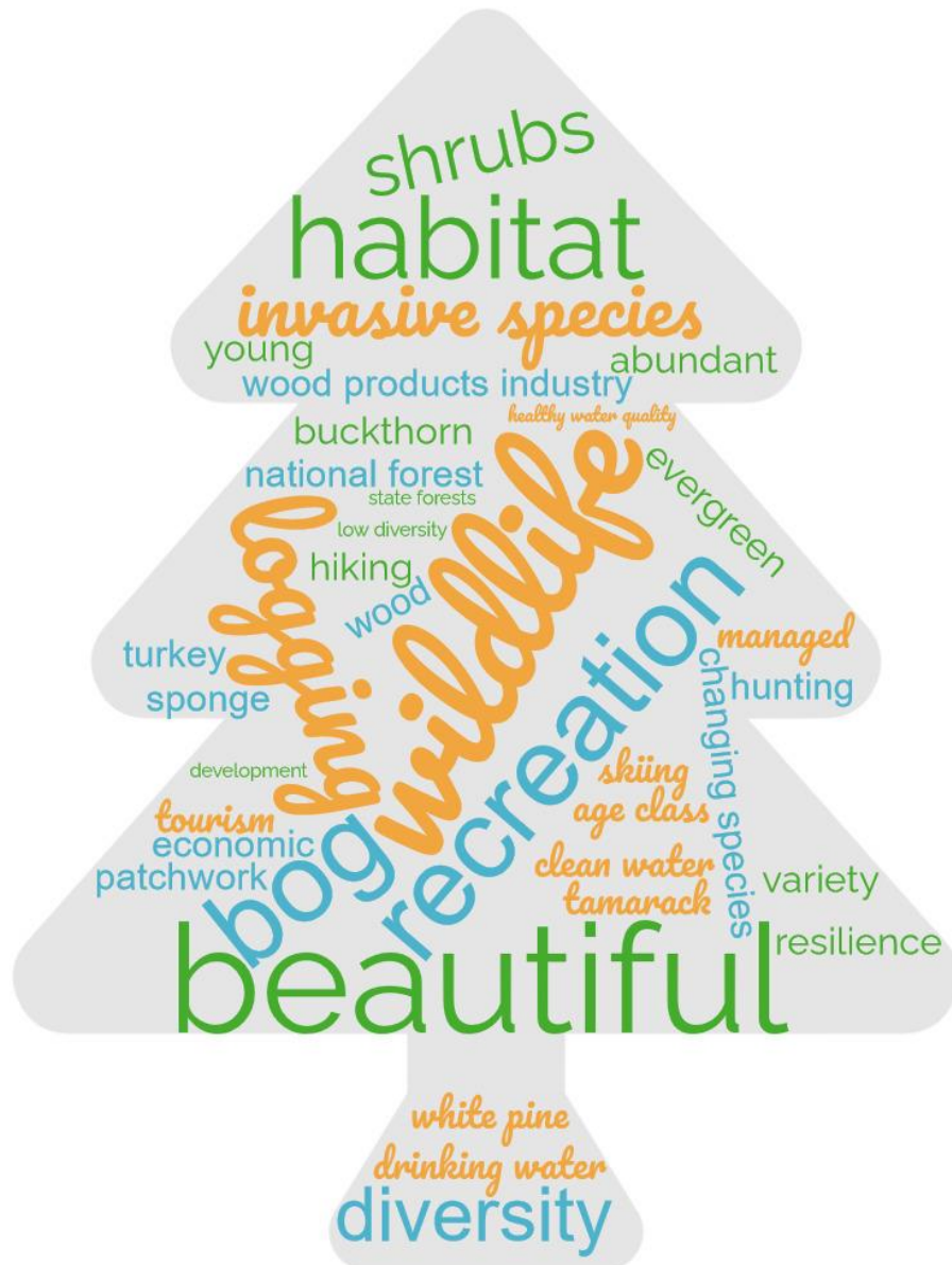
Figure 3. Word cloud depicting the diversity of responses to the question, “when you think of the Upper Mississippi Grand Rapids Watershed’s forests, what comes to mind?”

To help us understand what issues and opportunities surround forests in the watershed, issues listed in previous plans, reports, state agency comment letters and public input were gathered and compiled into common themes, becoming the basis of creating the priority forests issues for the Upper Mississippi Grand Rapids Watershed.